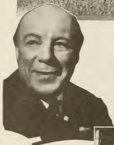
Edmund Gwenn, star of the Soundfilm "Warn London" (T9049—4 Reels), plays the part of a great criminologist who, losing all his wealth in a financial crash for which he blames lack of police supervision, becomes the master-mind behind a band of criminals.