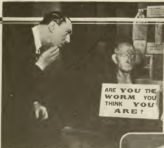
Comical incidents abound in "Strike It Rich" (T9129—4 Reels) starring George Gee, who also leads in "Cleaning Up" (T9130—4 Reels).