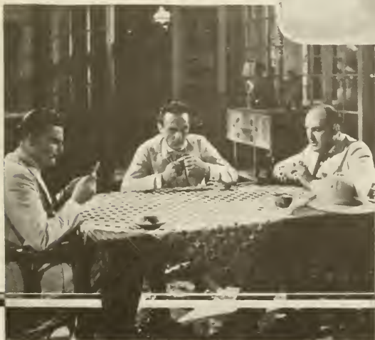
Edgar Wallace's pen wrote no more gripping story than "The Green Pack" (T9037—5 Reels), starring John Stuart, Aileen Marson and Garry Marsh.