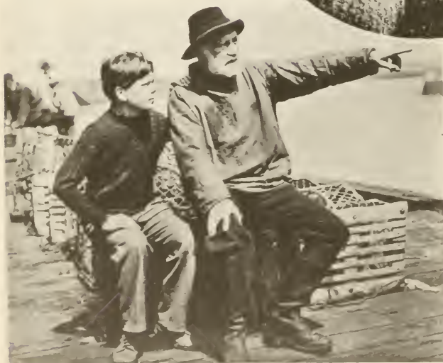
The drama of fisherfolk, "Turn of the Tide" (SB30429 — 4 Reels) stars John Garrick and Geraldine FitzGerald, with J. Fisher White, Wilfred Lawson and Niall MacGinnis.