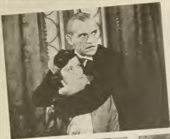
From the Talkie film entitled "Juggernaut" (T9056 — 6 Reels). Boris Karloff, as a doctor, finds in Nemesis an uncompromising adversary.