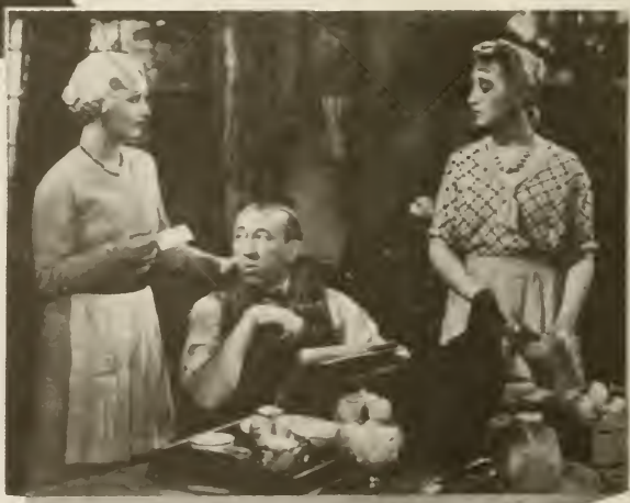
Gordon Harker and Binnie Hale in "High Society" form a delightfully funny comedy team in "This Is The Life" (T9126—4 Reels).