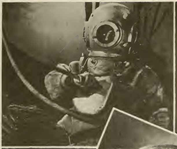
Telling of the strange creature in Loch Ness, "The Secret of the Loch" (SB30176 — 3 Reels in Silent; T9002 — 6 Reels in Sound), stars Seymour Hicks.