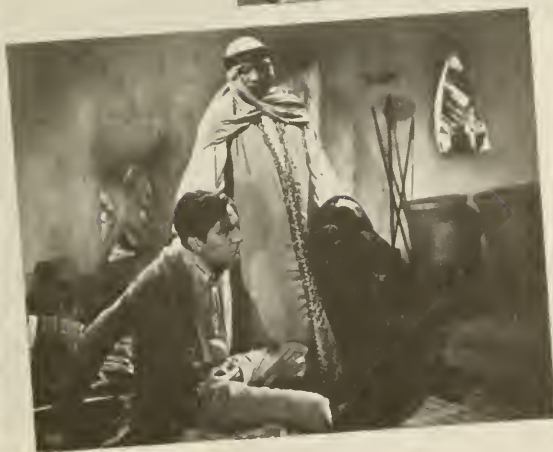
A spectacular drama centred round an act of heroism that sentences a man to death — "Jericho", (T9042 — 5 Reels), starring Paul Robeson.