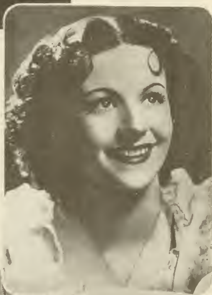
Beautiful Margaret Lockwood, leading player in the drama "Jury's Evidence" (T9036—5 Reels) and in the thriller "The Case of Gabriel Perry" (T9047—6 Reels) as well as the Silent film "Midshipman Easy" (SB30285—4 Reels) can always be relied upon for a fine performance.