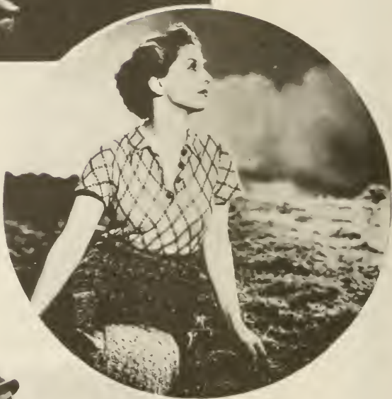
Hirta, a grim and desolate island of the Shetland group, is the setting of "The Edge of the World" (SB30324 — 4 Reels in Silent; T9038 — 6 Reels in Sound).