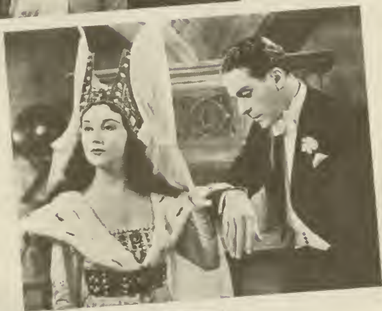
The Sound-film "When Knights Were Bold" is great fun for Jack Buchanan, with Fay Wray and Garry Marsh, as well as for you (T9101—6 Reels).